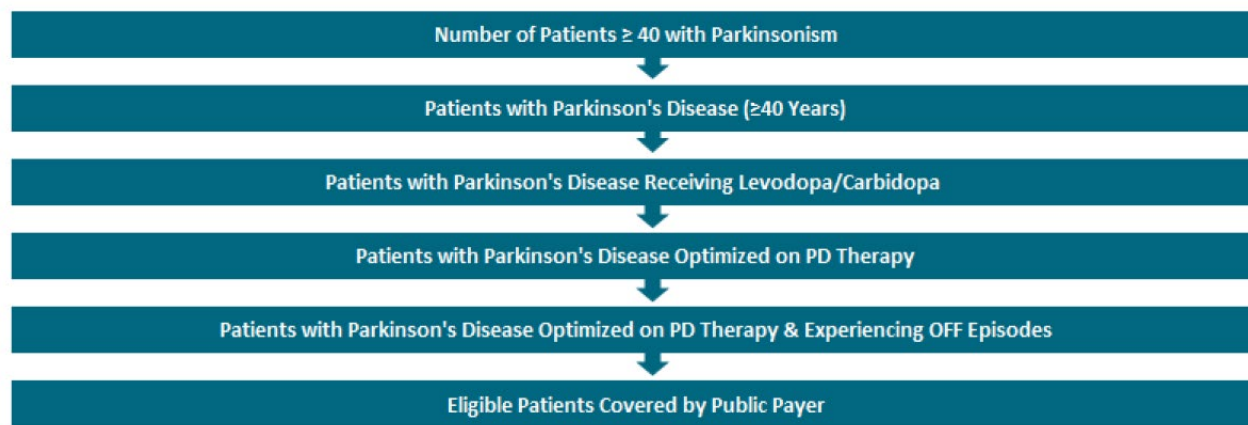
Figure 2: Sponsor’s Estimation of the Eligible Population Size

The submitted budget impact analysis assessed the introduction of APO SL as an adjunct to SoC for the acute, intermittent treatment of OFF episodes in adult patients with PD. The budget impact analysis was undertaken from the national public payer perspective for the Canadian setting over a 3-year time horizon (2021 to 2023) using a prevalence-based approach. An overview of the sponsor estimation of the eligible population size can be found in Figure 2. The sponsor included drug acquisition costs but excluded drug price adjustments (i.e., deductibles, markups, co-payments, dispensing fees, and premiums). Key inputs to the budget impact analysis are documented in Table 22.